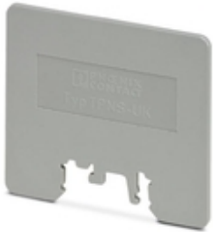
Partition plate, length: 80 mm, width: 2 mm, height: 70 mm, color: gray

Please be informed that the data shown in this PDF Document is generated from our Online Catalog. Please find the complete data in the user's documentation. Our General Terms of Use for Downloads are valid ( http://phoenixcontact.com/download )